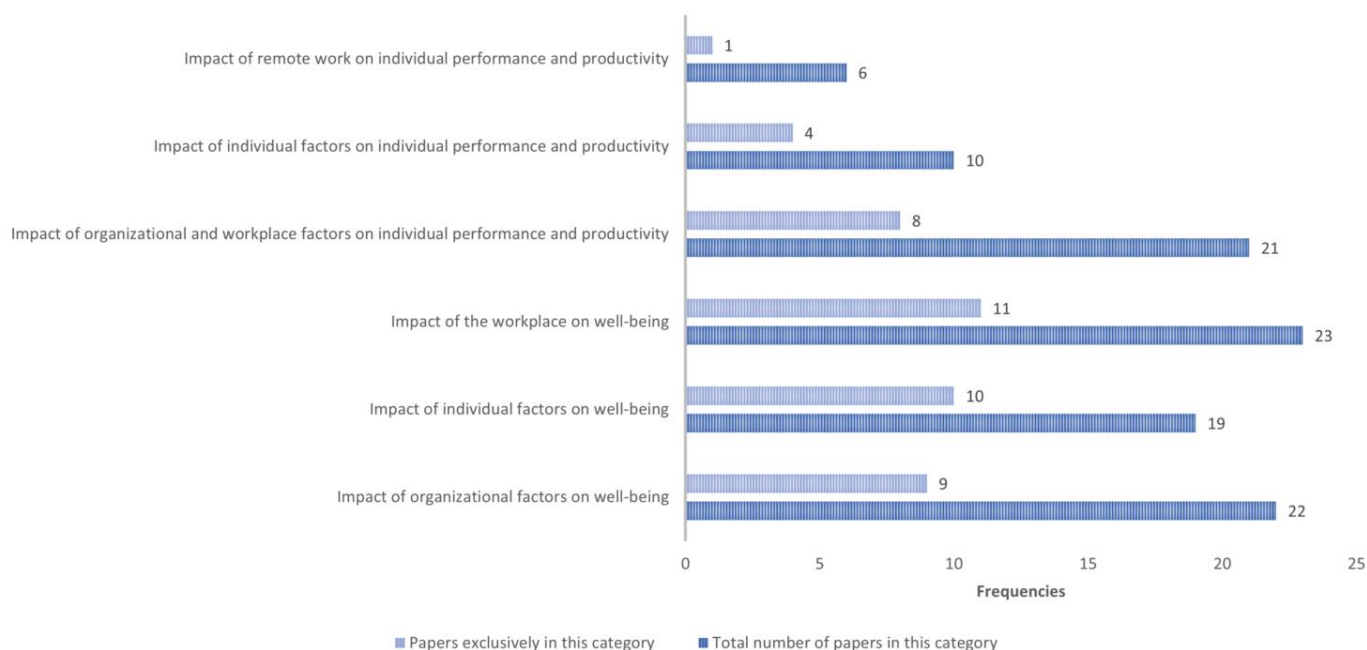
Figure 2. Papers distribution across categories.